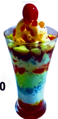
Desi Special Falooda